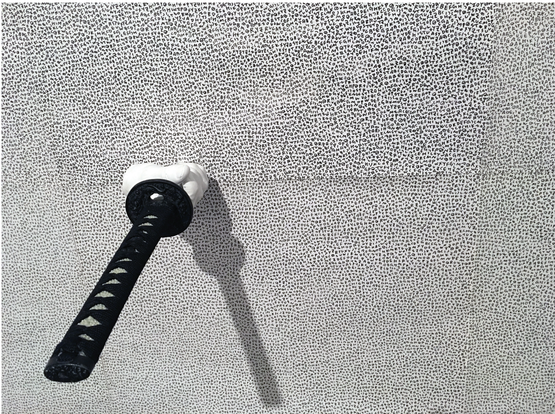
HARAKIRI (detail), sword, hand and drawing installation, 2016