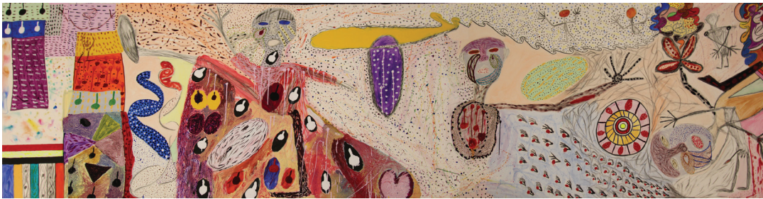
Lines We Must Cross , mixed media on paper, 51.5" x 184", 2008