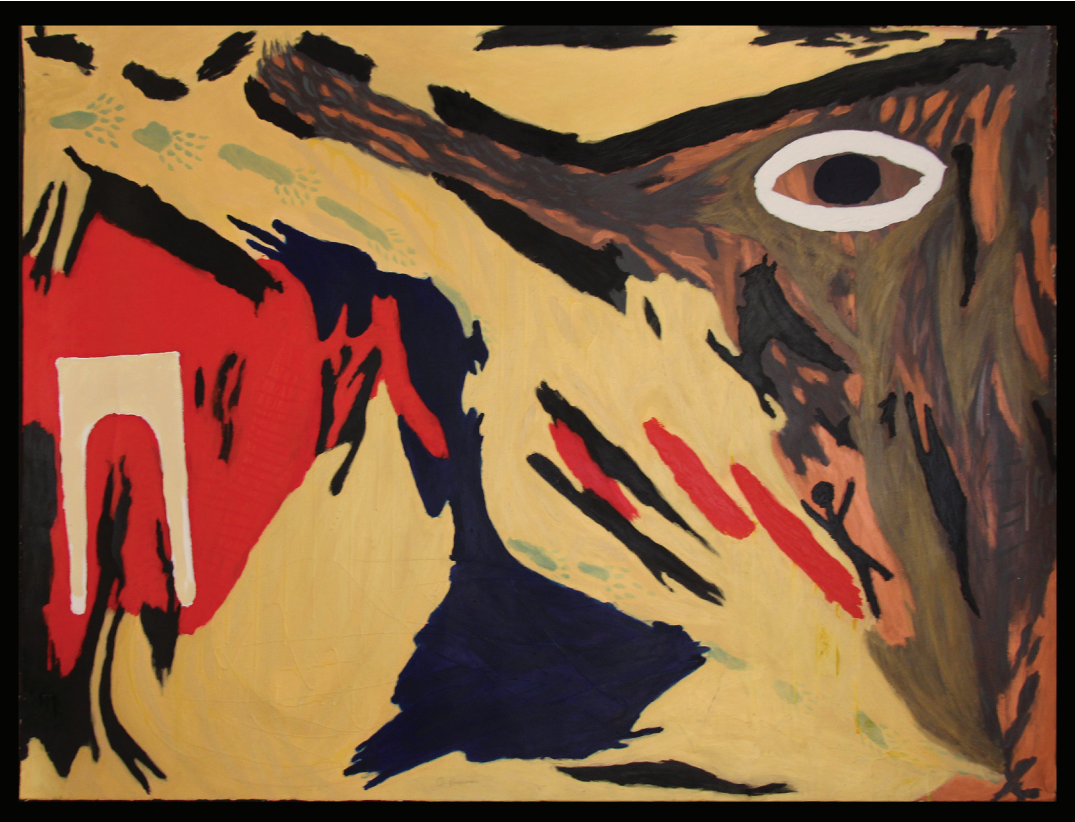
A Stroll Down Gold Street , oil and acrylic on paper, 50.75" x 64.75", 2012