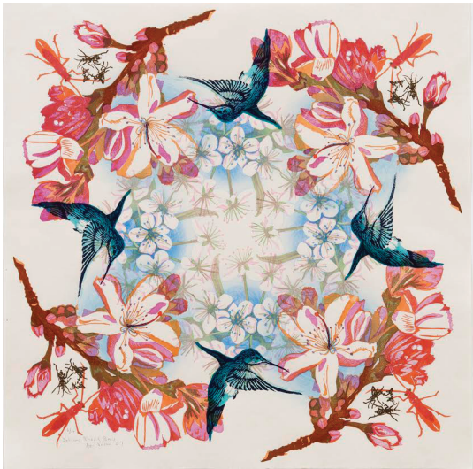
Top left: Yasu Shibata , Kirishima , Mokuhanga, ed. 5/16, 14 x 14" each, 2013